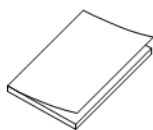
QSG (× 1)