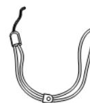
Wrist Strap (× 1)